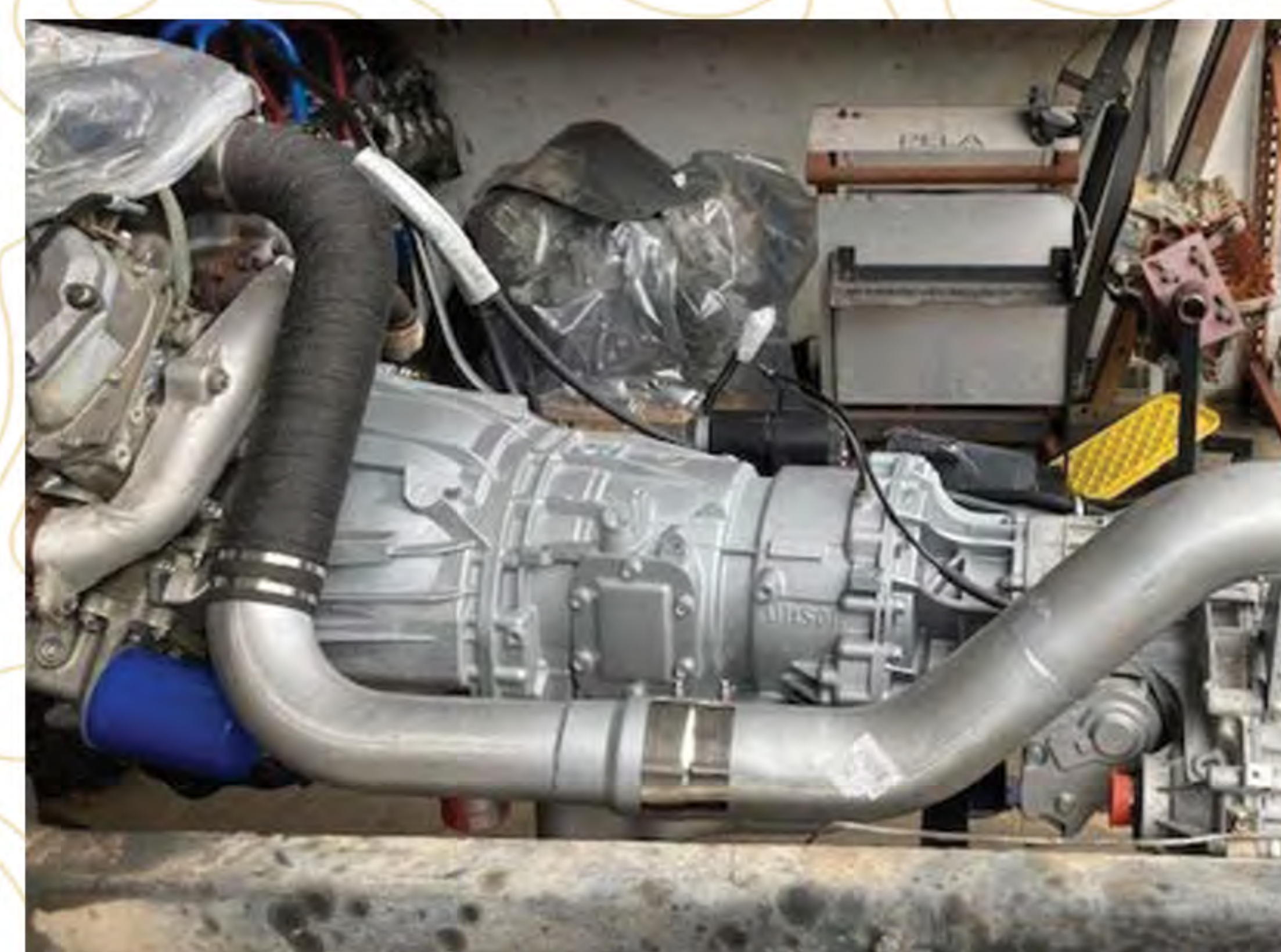
[G] & [25] Downpipe installed