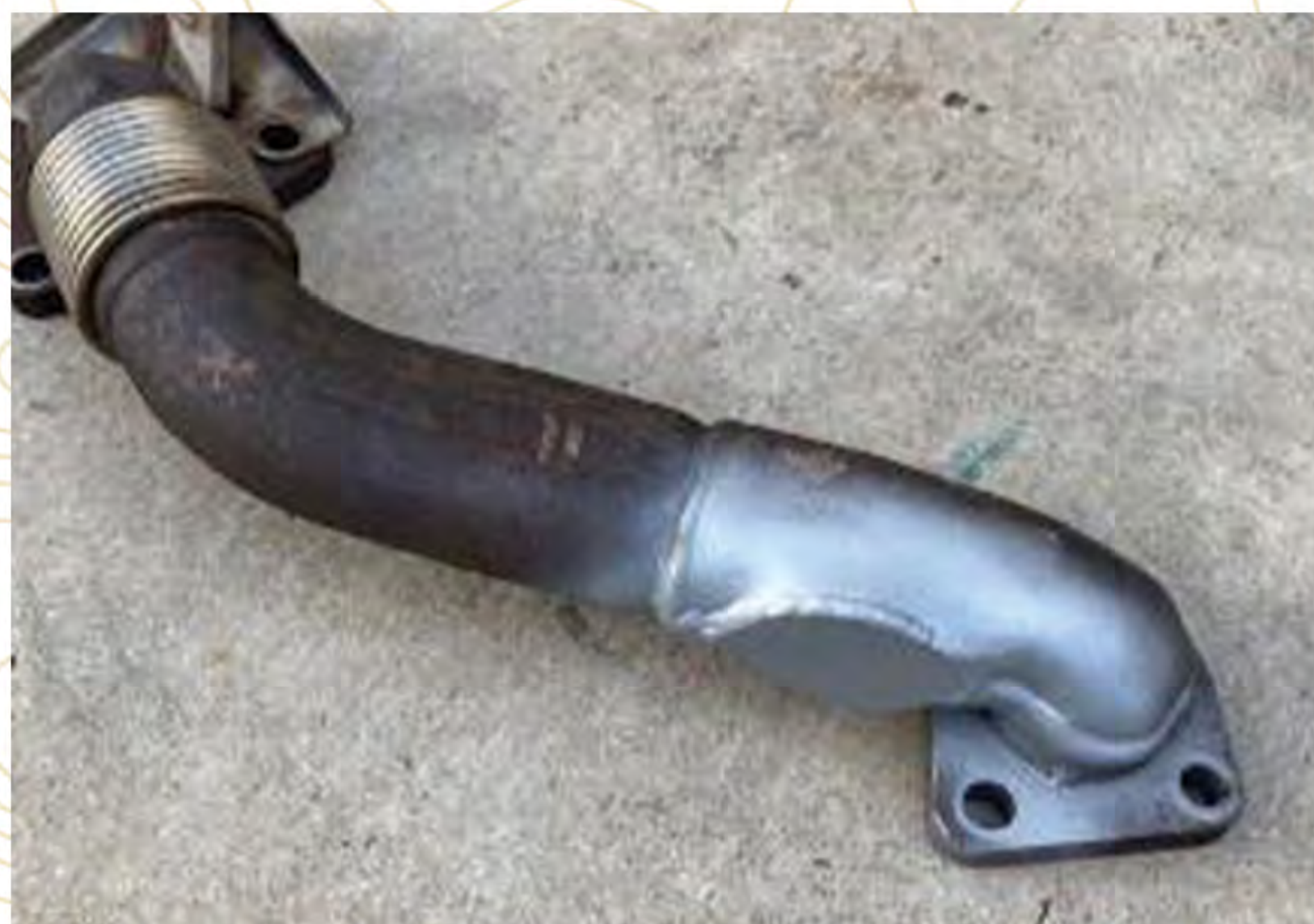
Modified Up Pipe

Modify PS Turbo up pipe. Install Y-Bridge [B]. Install new Thermostat Housing [20], Oil Fill Tube [21], Engine Cooling Fan [22]. (Requires Fan Clutch #216017 Car quest)