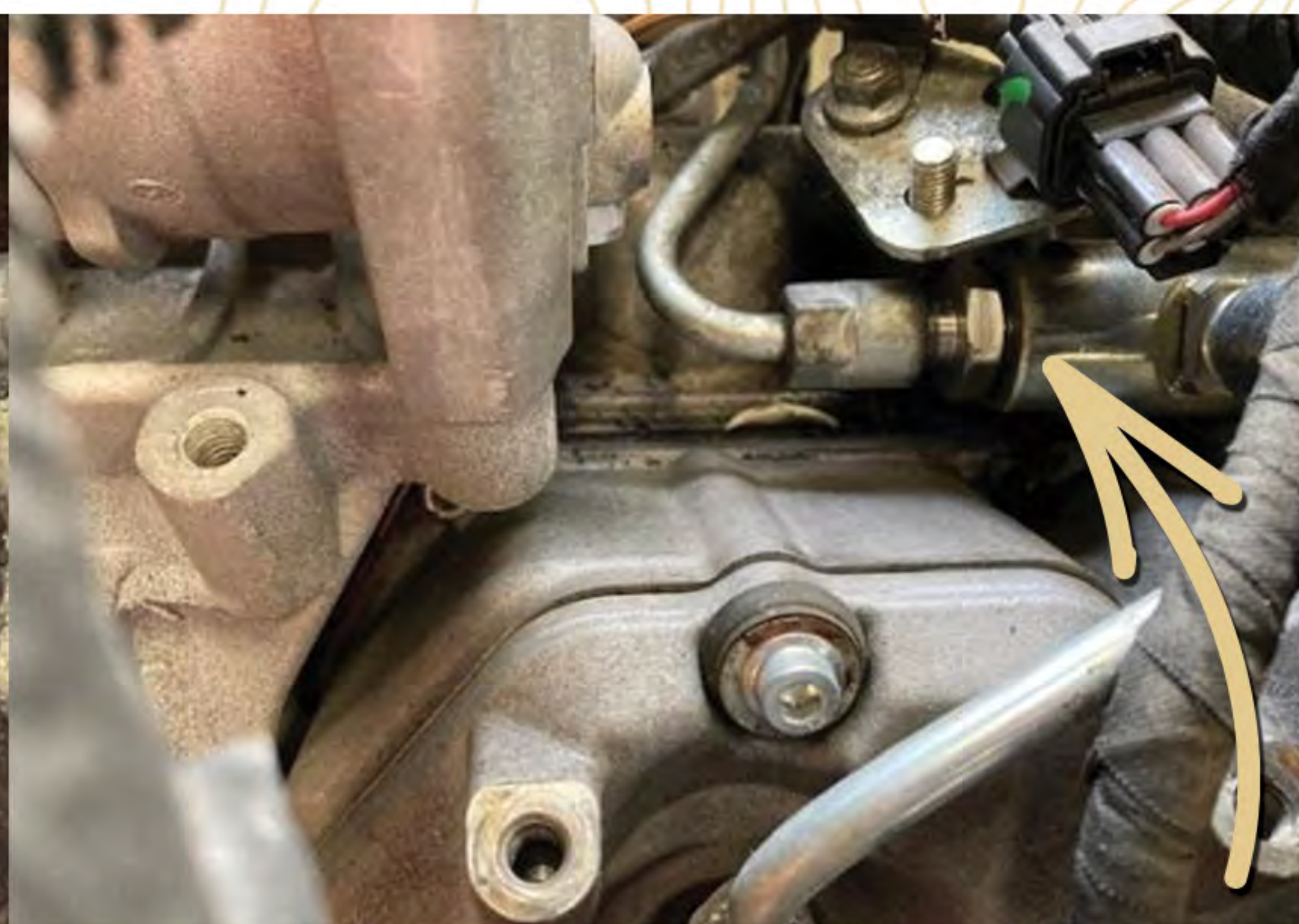
[29] at DS Fuel Rail (front)