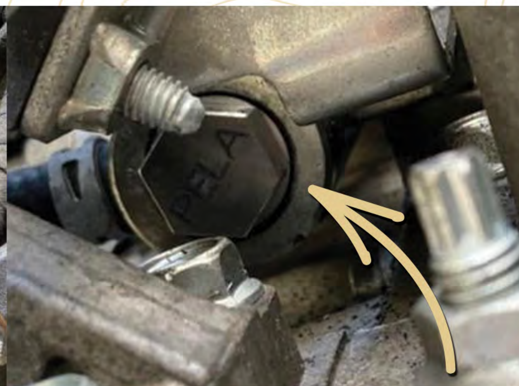
[30] at DS Fuel Rail (rear)

Modify PS Turbo up pipe. Install Y-Bridge [B]. Install new Thermostat Housing [20], Oil Fill Tube [21], Engine Cooling Fan [22]. (Requires Fan Clutch #216017 Car quest)