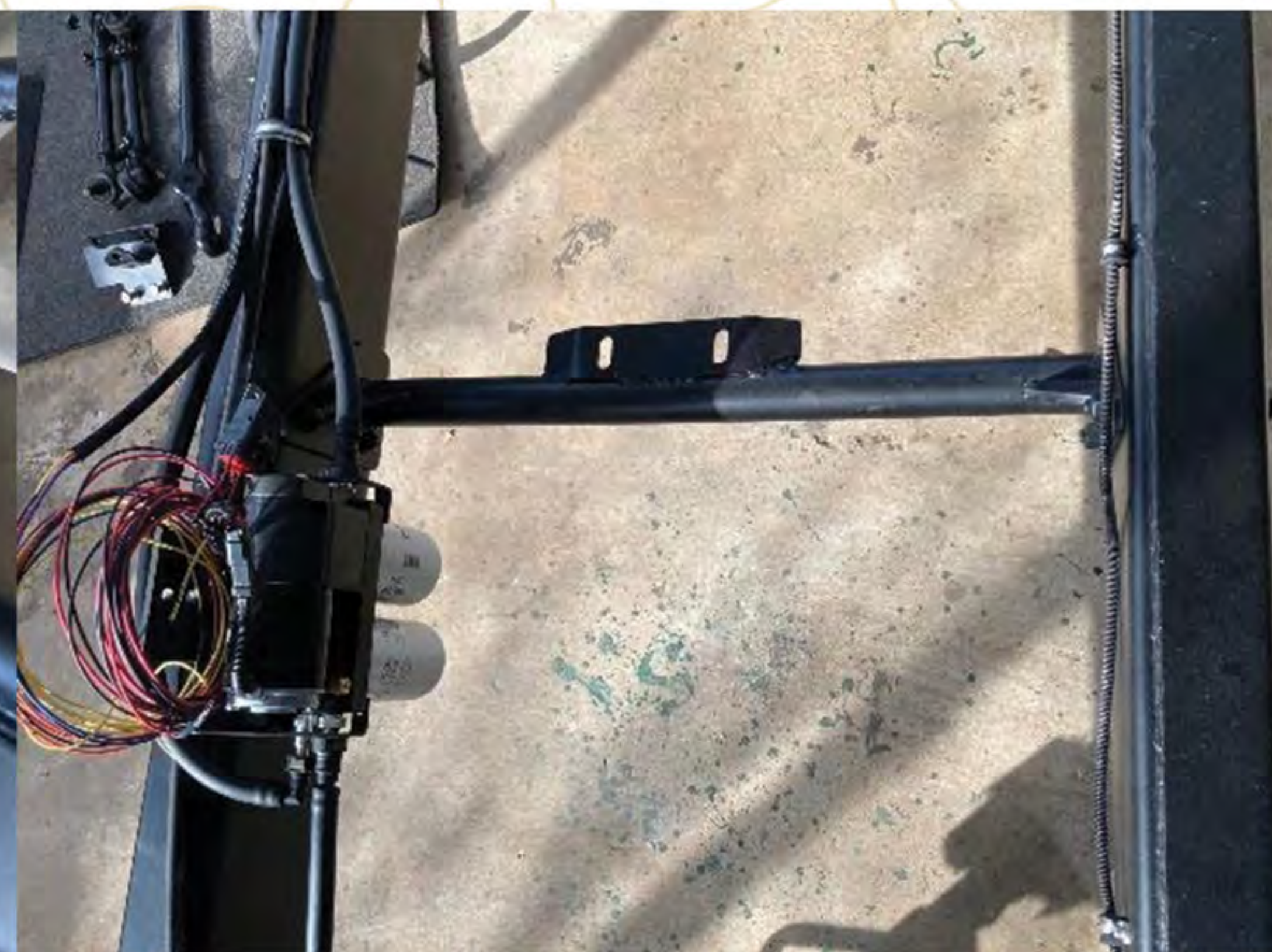
[3] + Lift Pump Mounting