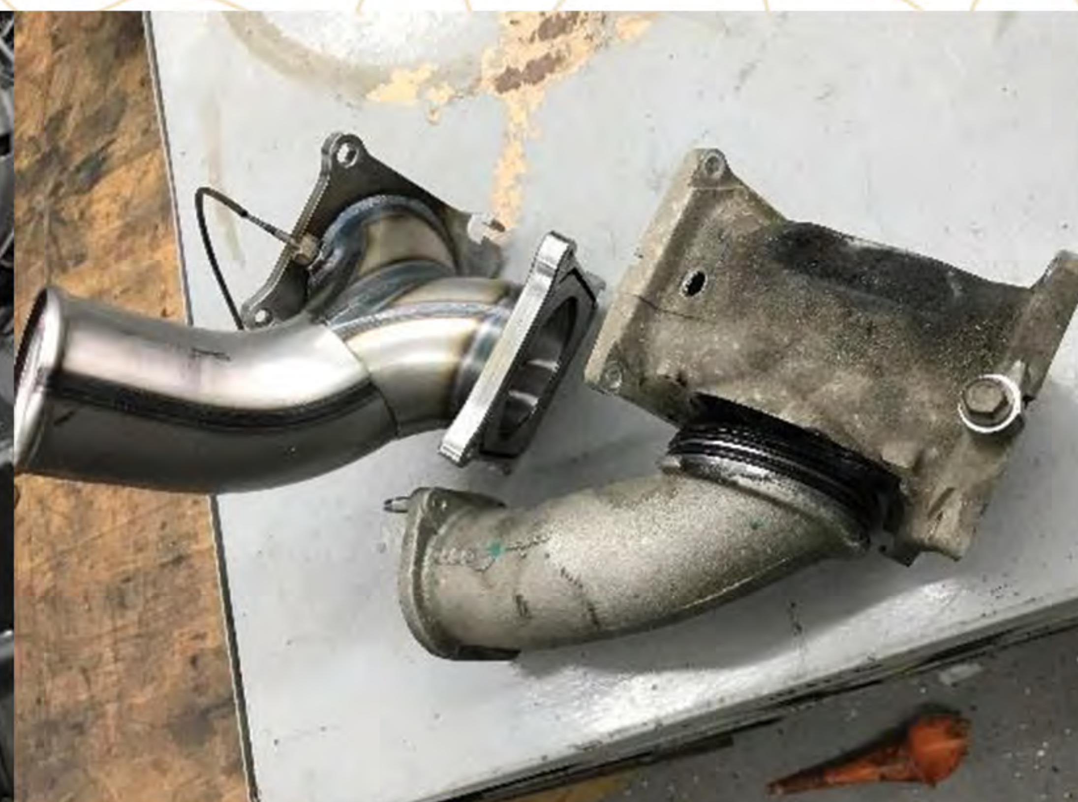
Y-Bridge vs Stock