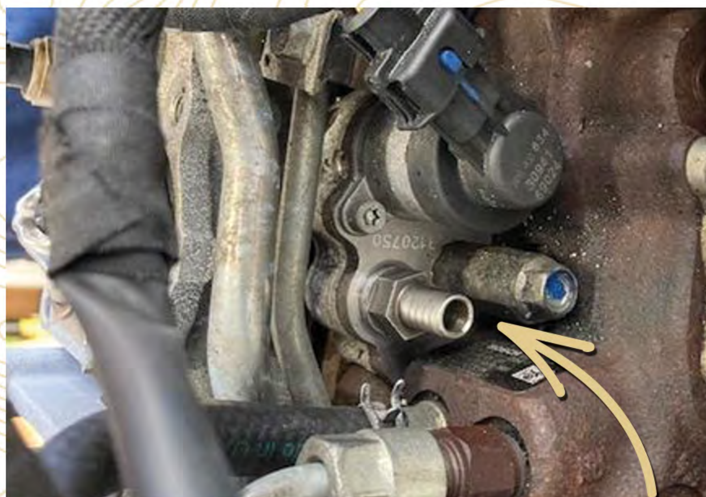
[28] CP3 inlet

Install the following kit parts on the engine: Engine Cooling Fan Blade [22] Thermostat Housing [20], Oil Fill Tube [21], CP3 inlet fitting [28], Ported Fuel-rail fitting [29], Race Valve [30].